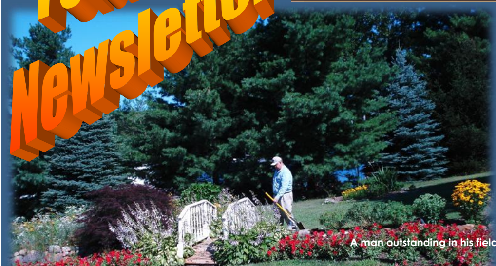
A man outstanding in his field.